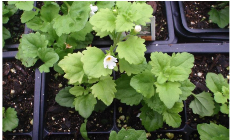
Bacopa - more advanced symptomology of elevated substrate pH in which the leaves have an overall yellow coloration.