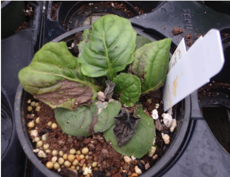
Gerbera - symptoms of excess substrate electrical conductivity with the associated tissue necrosis.