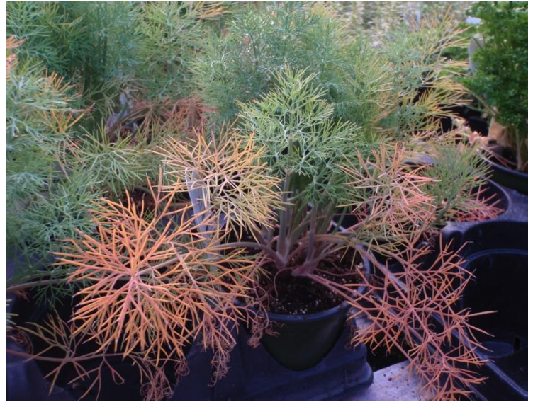
Dill - lower leaf yellow and orange coloration associated with low substrate electrical conductivity.