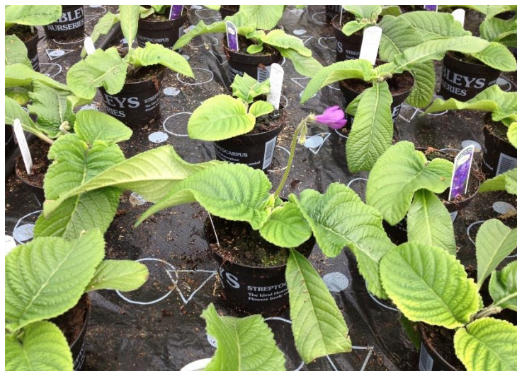
Streptocarpus - overall yellowing of the plants with advanced symptomology of low substrate electrical conductivity.