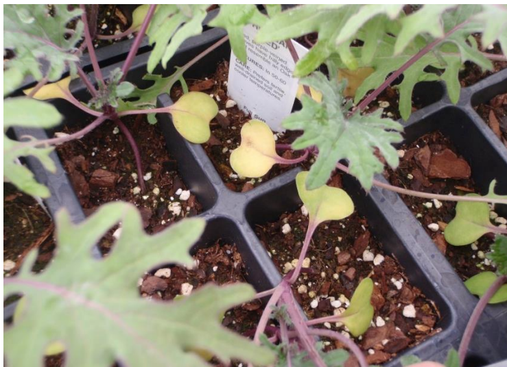
Red Russian Kale - lower leaf yellowing associated with low substrate electrical conductivity.

If the EC values are excessively high, leach the substrate twice with back-to-back clear water irrigations. Then allow the substrate to dry down normally before retesting the EC. If EC levels are still too high, repeat the double leach. Once the substrate EC is back within the normal range, use a balanced fertilizer at a rate of 150 to 200 ppm N.