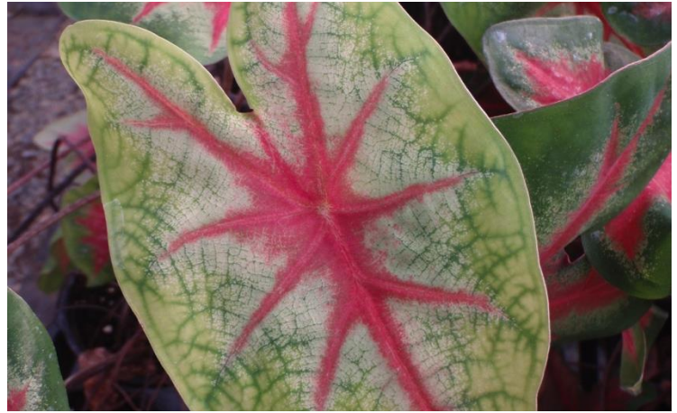
Caladium - typical symptomology of high substrate pH (upper foliage interveinal chlorosis).

The target pH for many species is between 5.8 and 6.2. Higher pH values will result in Fe deficiency and lead to the development of interveinal chlorosis on the upper leaves. Check the substrate pH to determine if it is too high. Be careful when lowering the substrate pH, because going too low can be much more problematic and difficult to deal with.