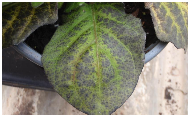
Gerbera - typical symptomology of low substrate pH induced iron/manganese toxicity on the lower leaves.