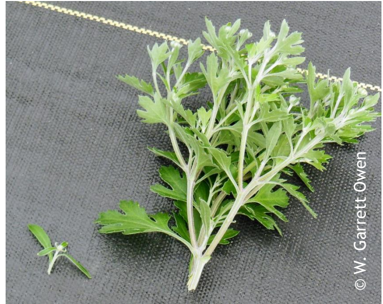
Figure 4. Example of crown bud (left) excised from an outdoor garden mum ( Chrysanthemum x morifolium ) exposed to several cool nights compared to an excised branch (right) of a garden mum grown under protection.