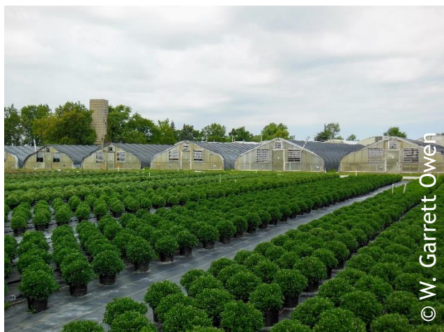
Figure 1. Fall garden mums ( Chrysanthemum x morifolium ) are often grown outdoors unprotected and exposed to seasonal environmental conditions.

As spring 2021 comes to an end, it is time that we start thinking about challenges that may arise during summer production of fall flowering garden mums ( Chrysanthemum x morifolium ). Fall garden mums are often grown outdoors unprotected and exposed to seasonal environmental conditions (Fig. 1). Growers usually rely on natural daylength (photoperiod) and temperature to control crop timing throughout the production cycle. This is important because garden mums are short-day plants which means flower initiation and bud development occurs rapidly when the day length is short, and nights are long. However, temperature interacts with photoperiod, and can have a greater influence on flower initiation and bud development in mums, and this is where challenges can arise.