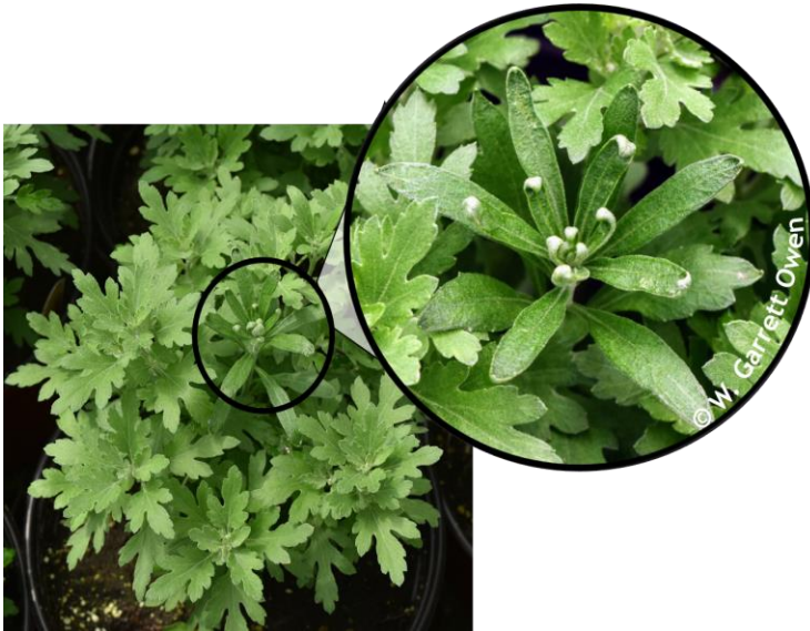
Figure 3. Crown buds in an outdoor garden mum ( Chrysanthemum x morifolium ) production.