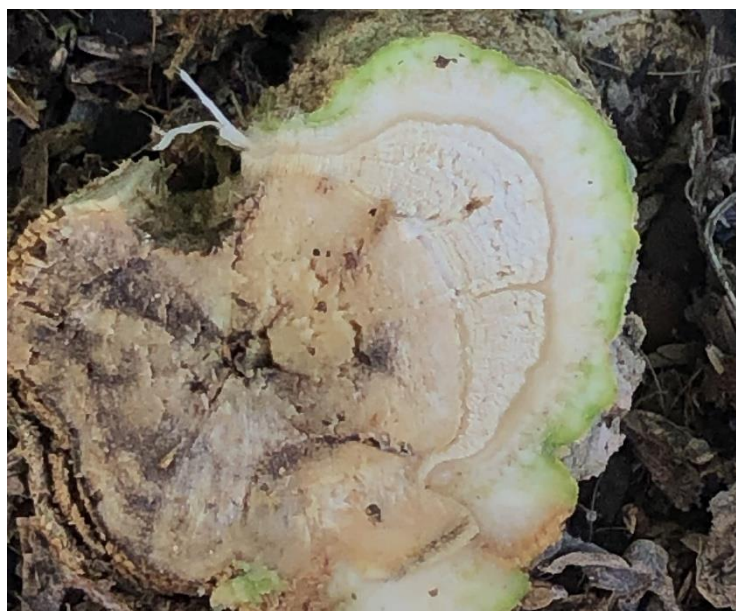
Figure 3. Discolored water-conducting vessels apparent when cutting through the stem near the base is a sign of Fusarium oxysporum .