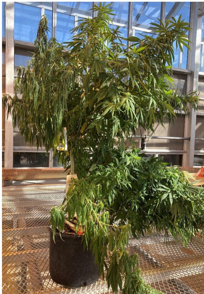
Figure 2. A mother plant of hemp exhibiting severe wilting of leaves and branches due to infection with Fusarium oxysporum .

F. oxysporum can come from water, air, substrate or from contact with a contaminated source. Roots, stems, and flowers are susceptible. The pathogen can be found at all stages of the hemp plant growth cycle, which means it can be spread to all areas of a facility. Fusarium favors warm and humid environments, and warm soil temperatures. In the soil, Fusarium fungi is capable of remaining viable for long periods of time. Soil or media that has been saturated for prolonged periods would be considered susceptible to disease.