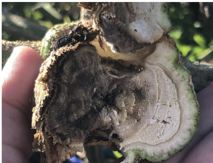
Figure 4. Advanced vessel discoloration apparent on a stem section from a hemp plant infected with Fusarium oxysporum .