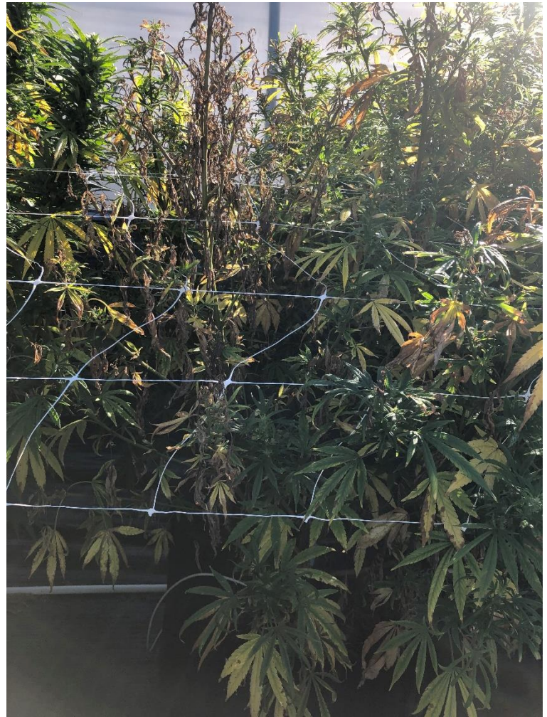
Figure 6. Advanced Fusarium wilt causing necrosis and death of a hemp plant.

Disclaimer: Mention of trademarks or brand names is for informational purposes only and does not imply its approval to the exclusion of other products that may be suitable. Always follow the pesticide label. The label is law!