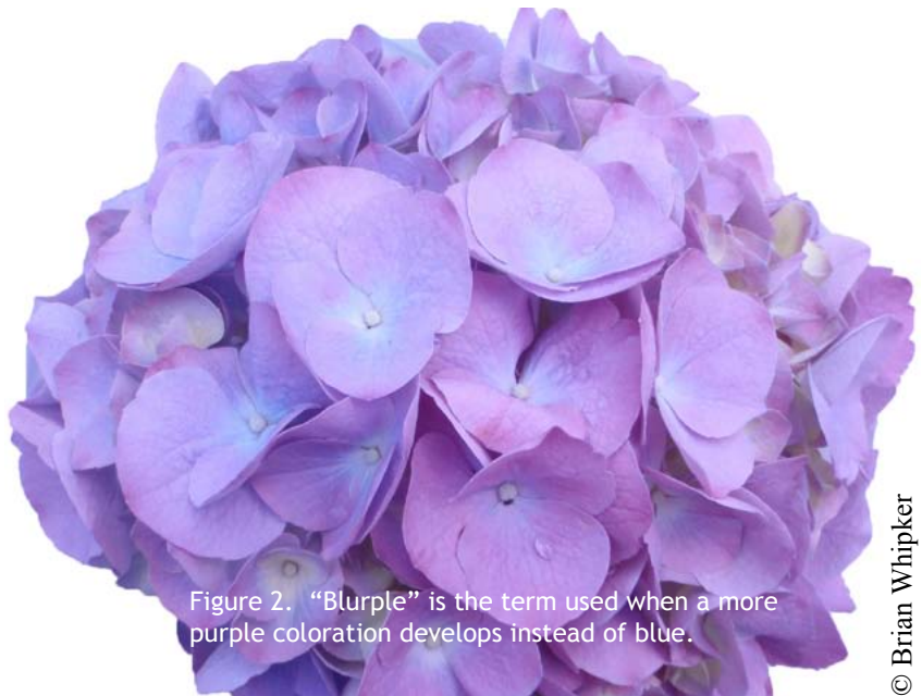
Figure 2. “Blurple” is the term used when a more purple coloration develops instead of blue.

Once growers have taken the appropriate steps to achieve the desired pH, an adequate supply of Al must be available to the plant too. Aluminum should only be applied to plants during the forcing process when a blue