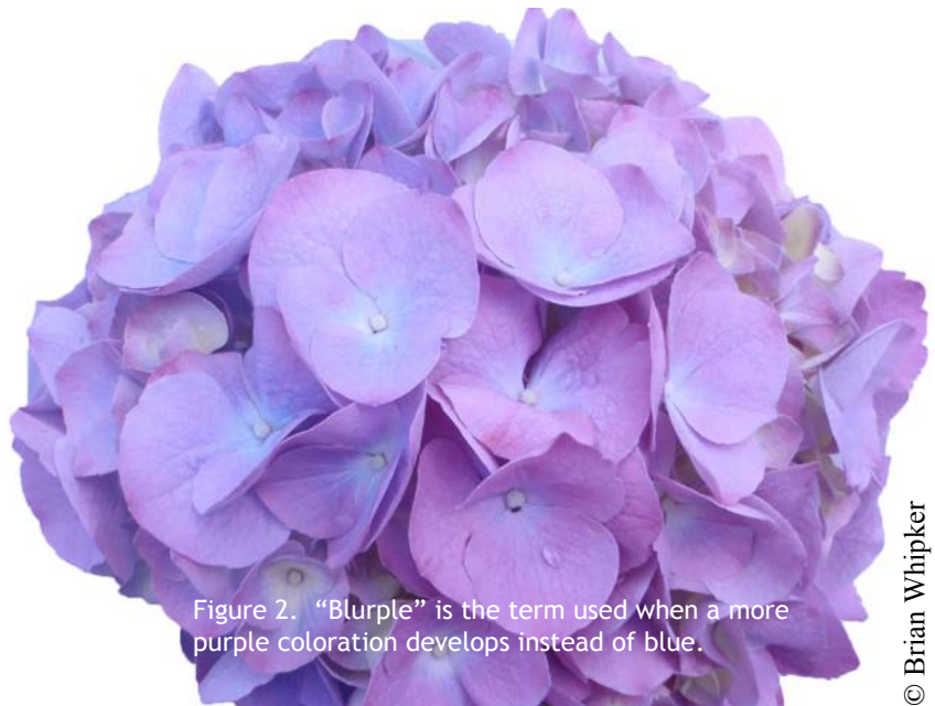
Figure 2. “Blurple” is the term used when a more purple coloration develops instead of blue.

Once growers have taken the appropriate steps to achieve the desired pH, an adequate supply of Al must be available to the plant too. Aluminum should only be applied to plants during the forcing process when a blue