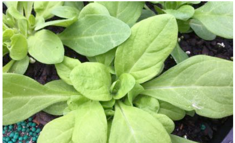
Figure 3. Close-up of yellow leaf coloration.