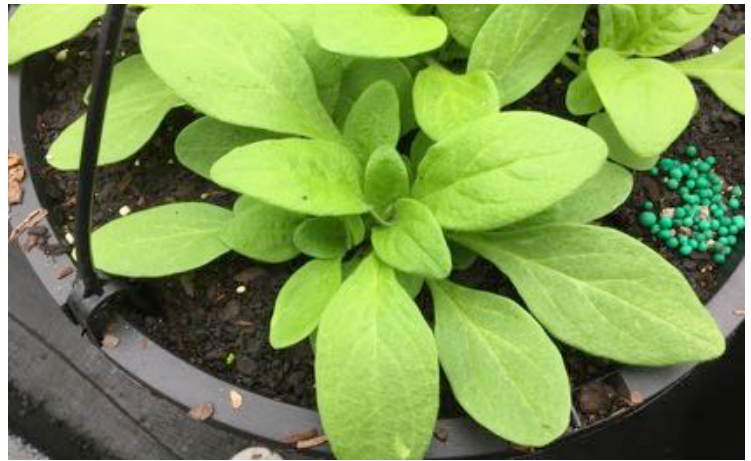
Figure 2. Yellow coloration of petunias.