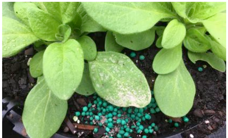
Figure 4. Lower leaf spotting was the result of excessive slow release fertilizer being supplied.