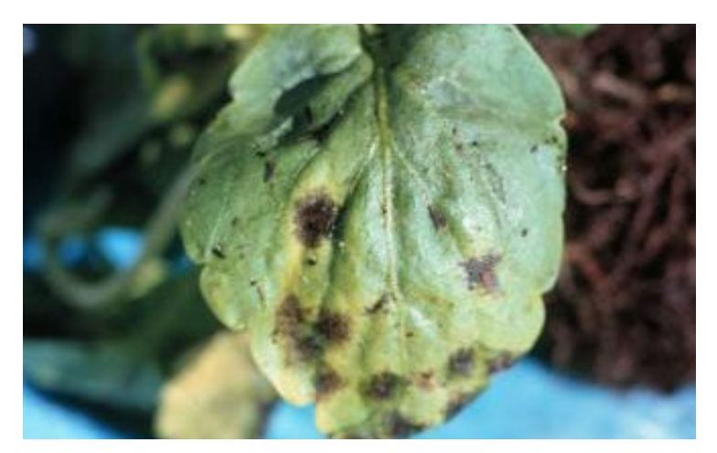
Figure 2: Multiple small, purplish leaf spots with a fringed bordered due to Cercospora leaf spot on pansy.