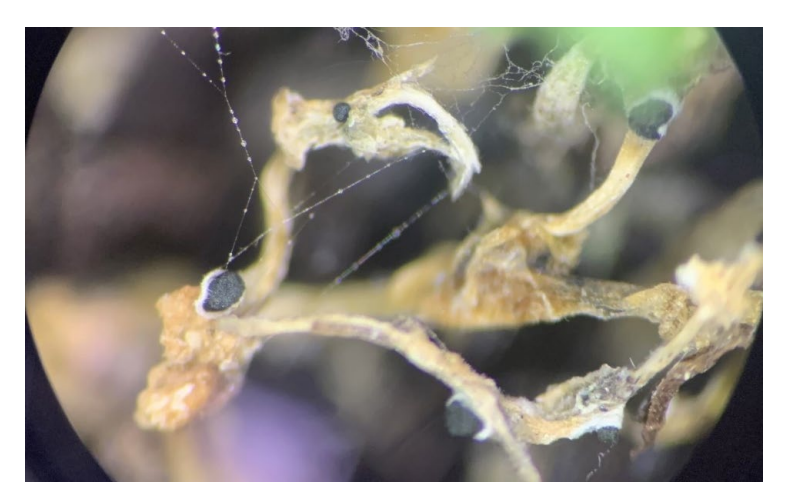
Figure 6: Myrothecium sporodochia consisting of a mass of dark spores on a tuft of white fungal growth can be seen on infected tissues.