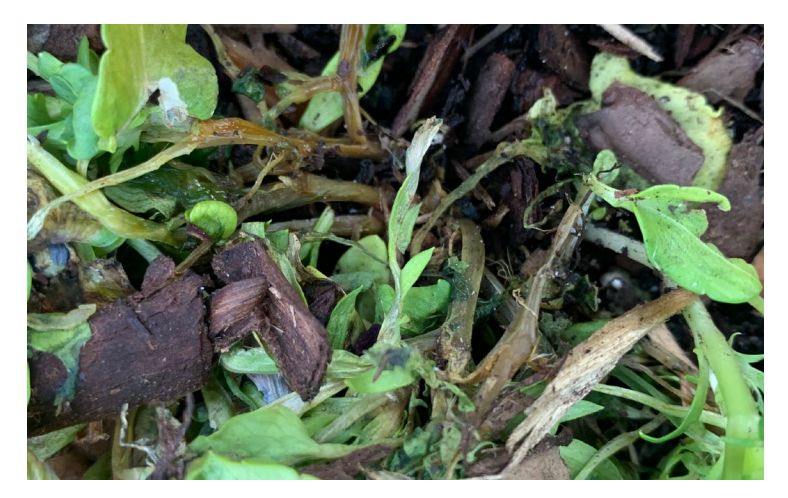
Figure 5: Myrothecium crown rot causes a brown, soft rot of pansy stems. Plant will collapse and die from infection.