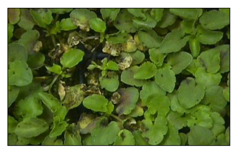
Figure 3: Cercospora leaf spot on pansy can spread quickly and kill infected leaves and small plants.