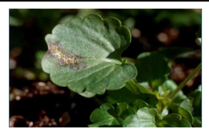
Figure 1: Cercospora leaf spot on pansy showing purplish, fringed margin with a tan center. Spores are produced on both the upper and lower leaf surfaces.

With the overcast, humid conditions in the southeastern USA, powdery mildew disease has been a problem in pansy production within greenhouses. However, if the current wet weather trends continue, it is unlikely that the disease will be of concern in landscape installations because wet foliage is not conducive to powdery mildew disease development. Powdery mildew infection causes patches of white fungal growth usually seen on the upper leaf surface. If infection is severe, leaves may become distorted and purplish (Figure 4). Powdery mildew develops under high humidity conditions. Plants that are nutritionally stressed are more susceptible to powdery mildew infection than non-stressed plants.