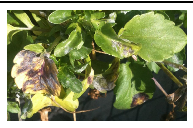
Figure 4: White patches of fungal growth is the primary sign of powdery mildew infection. Often purplish or yellow discoloration is associated with powdery mildew.

The mention of specific active ingredients in this alert does not constitute an endorsement or recommendation of, nor discrimination against similar products not mentioned. Always read product labels and use them as directed on the label.