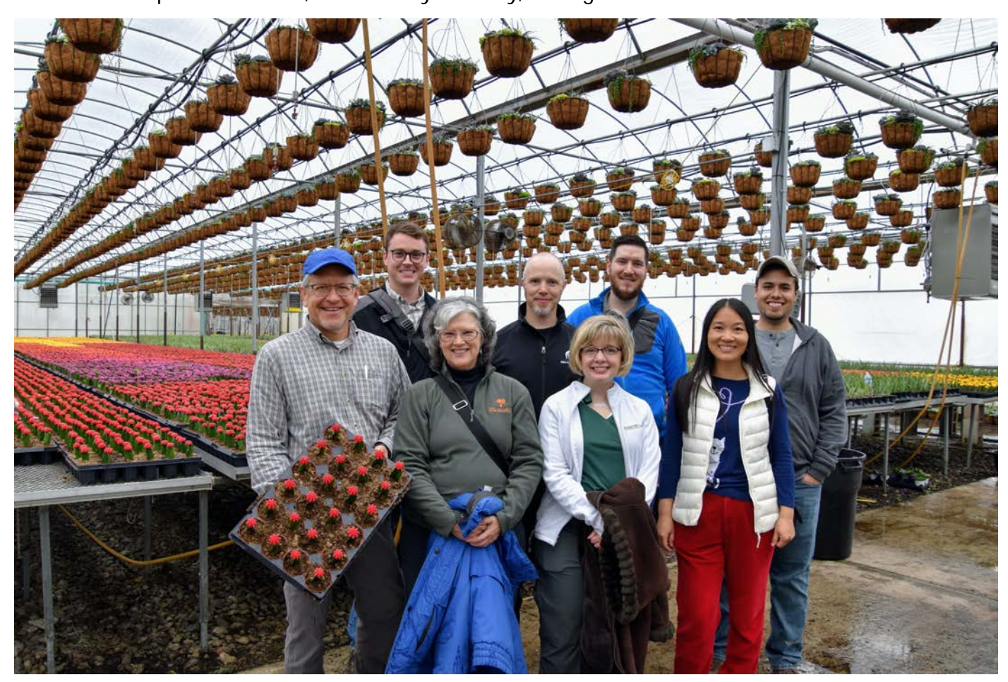
e-GRO team members meet to visit greenhouses nationwide and provide hands-on learning opportunities for University faculty, Extension professionals, and graduate students.

The e-GRO team evolves as specialists retire or those who participated as graduate students go on to hold Extension positions after their studies. Prior to the pandemic, the e-GRO team would meet yearly for a diagnostic tour in different areas of the country. We'd tour greenhouses and other controlled environment production facilities, and it was a great opportunity for mentorship and personalized coaching for the next generations of floriculture experts. We hope to resume these in-person meetings in 2022 to continue to grow the materials available from e-GRO and provide hands-on learning opportunities for new Extension professionals, University faculty, and graduate students.