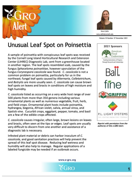
Figure 1. e-GRO Alerts are articles that provide timely information to growers on common plant production problems.

Over the past ten years, there has been 364 in-depth articles (Figure 1) or "Alerts" to bring grower's attention to plant production issues that our team is currently seeing in greenhouses across the county.