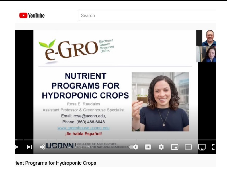
Figure 2. Nutrient Programs for Hydroponic Crops is a video on our e-GRO YouTube Channel with over 31,000 views.

PGR Mixmaster is a calculator on our website that can help you mix your PGRs by inputting the concentration and the quantity of final solution needed (Figure 3). It contains many of the common PGRs including: B-Nine, Fascination, Paczol, and Topflor.