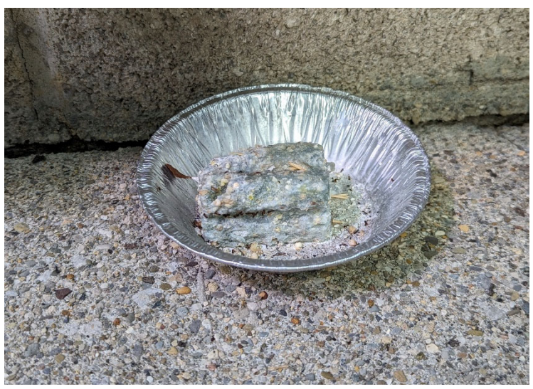
Figure 10. Example of a greenhouse deploying a rodenticide.