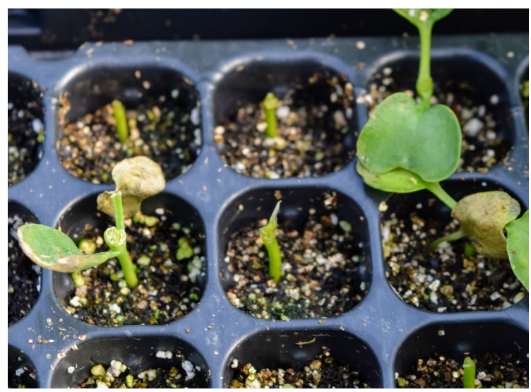
Figure 4. Plug damage caused my mice feeding.