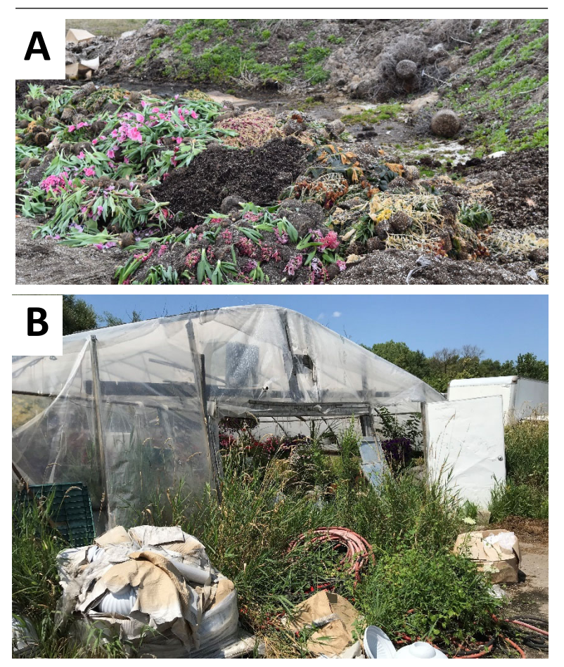
Figure 7. Remove (A) debris or (B) protected areas outside the overwintering or greenhouse structure to eliminate rodent habitats.

Many greenhouses have cats to help with rodent control, but most times they are off sleeping and sunbathing (Fig. 8). Baited snap traps can help control mice, rats, and voles (Fig. 9). Baits that are effective include peanut butter, oatmeal, and apple slices. Repellents have not been shown to be consistently effective and sometimes will be stockpiled or hoarded (pers. experience). Rodenticides or toxic baits marketed as anticoagulants or formulated with zinc phosphide may be used if trapping is not effective (Fig. 10), but care must be taken to protect other non-target animals and children. Baits formulated with zinc phosphide are restricted, therefore you much be a certified pesticide applicator to purchase and apply. Growers should always follow the manufacture directions and label rates before using any product.