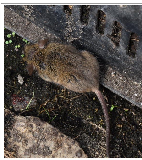
Figure 1. Overwintering tunnels and heated greenhouses create the perfect habitat for rodents such as rats.

Common rodents that may be encountered in