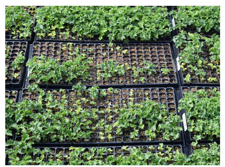
Figure 2. Plug trays where mice had eaten sown seed leaving behind partial trays.

Rodent control in overwintering structures and greenhouses begins with exclusion. Greenhouse and nursery growers should first identify entry points. Mice can squeeze through cracks, gaps, and holes about \frac{1}{4} -inch in size. Therefore, inspect growing environments and fix holes in polyfilm or polycarbonate and ensure door sills, louvers, and knee wall or baseboards are gap free. This also prevents cold air infiltration into the growing environment and eliminates the likelihood of chilling or freeze injury on crops. If gaps are found along the knee wall or baseboards of overwintering structures or greenhouses, then consider installing metal screening or mesh hardware cloth around the outside perimeter. Secure the screening to the knee wall or baseboards and bend the bottom edge away from the growing structure, and if possible, bury or secure by installing groundcover or sod pins. This technique will help mitigate tunneling or entry into the overwintering structure and greenhouse.