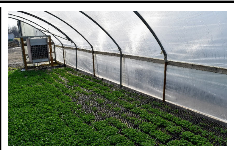
Figure 5. The severity of mice activity in a heated greenhouse and plug loss.

Greenhouse and nursery growers should monitor for rodent activity in overwintering structures and greenhouses. For mice and rats, monitor for droppings, digging of seed or removal of plugs or liners from pots, and damage to hardgoods. For voles, consider deploving the Apple Sign Test. This monitoring technique requires placing multiple empty pots or nursery containers upside down on the ground throughout the growing environment or suspected infested area. Ensure that you leave a slight gap between the container rim and the ground. Alternatively, a wooden shingle can be placed on the ground and propped up 3-to-4-inches off the ground or two wooden shingles can be used to create a tent at ground level. Allow the pots or shingles to sit in the growing environment undisturbed. After five days, place a small slice of apple under each pot or shingle. After 24 hours, inspect each pot or shingle to monitor feeding activity on the apple slice. Feeding activity will help identify where control is needed.