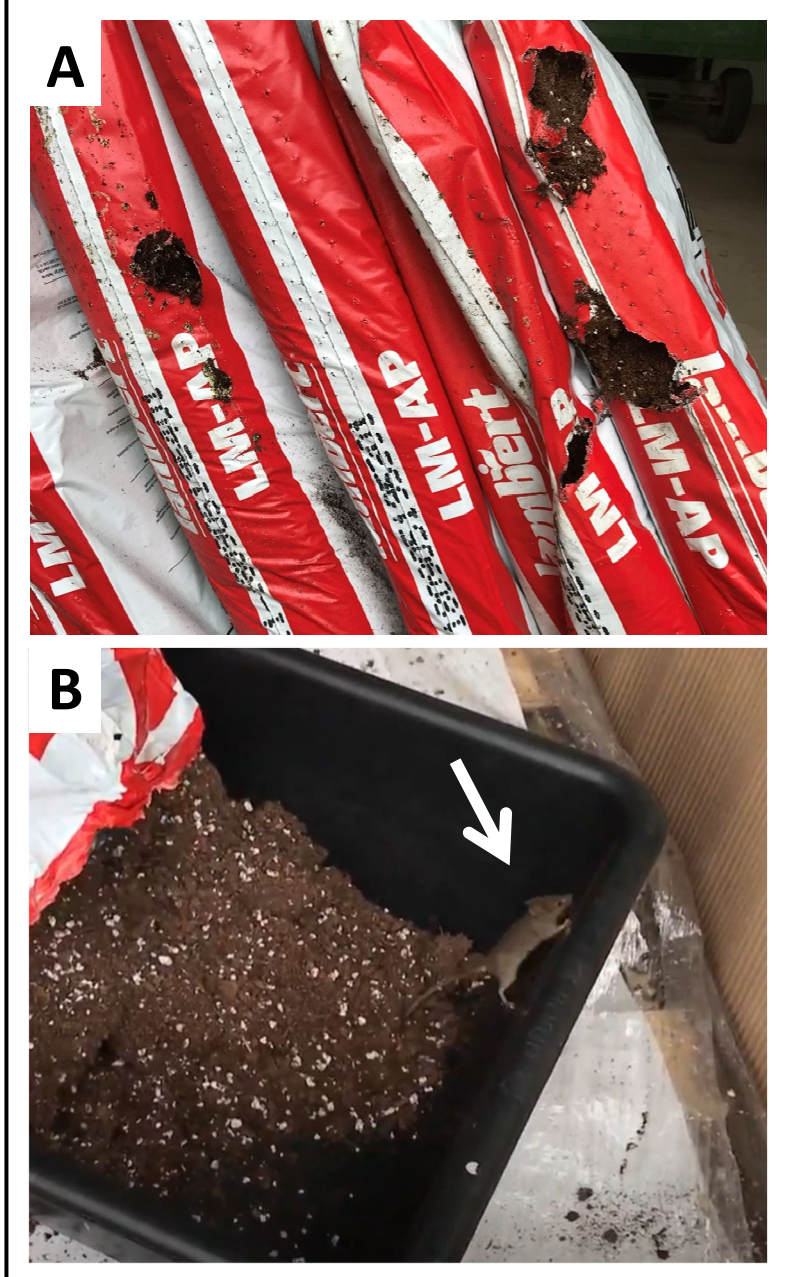
Figure 6. Example of (A) rodent damage to loose-filled bags of substrate and (B) rodent that caused damage while utilizing the substrate.