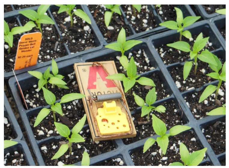
Figure 9. Snap trap used to protect seed and young plants from rodent activity.