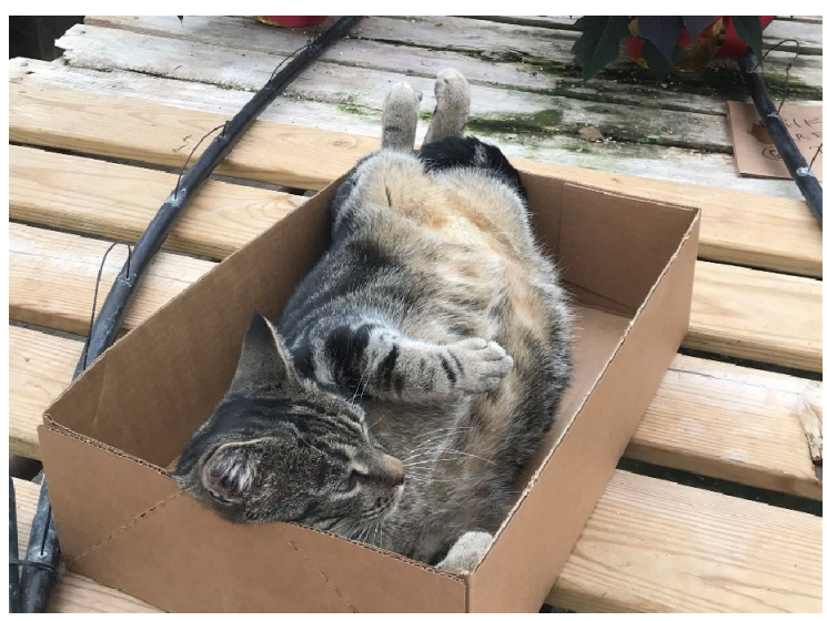
Figure 8. Greenhouse cat used to help with rodent control.