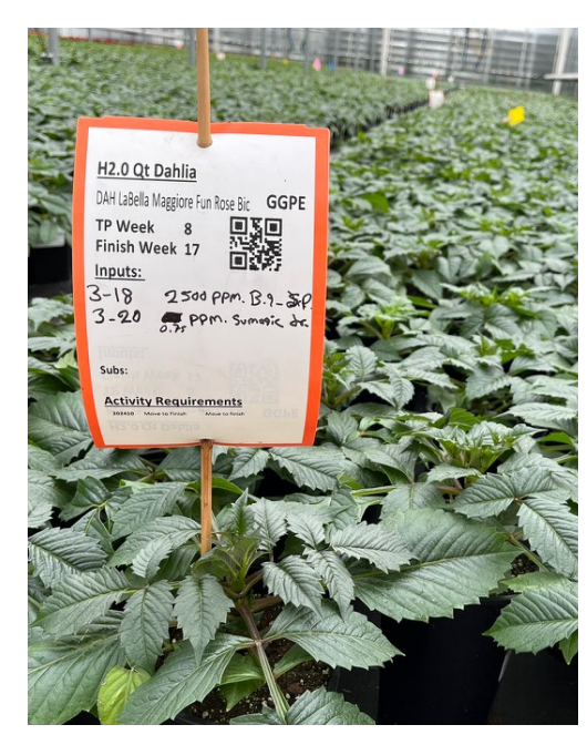
Photo 1. Aggressive varieties may require several PGR applications to maintain quality and be proportional to their container sizes.

floriculture team was visiting growers during week 14 (first week of April) and many growers were applying plant growth regulators/retardants (PGRs). Many were applying PGRs to prevent excessive elongation because of a recent string of cold, cloudy weather. Growers benefited from the relatively sunny and record-breaking warmth of February, which pushed growth of plants in the greenhouse, but that was followed by a series of cool,