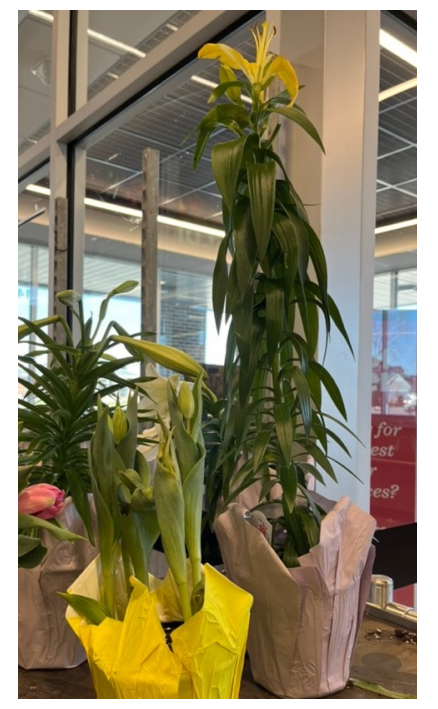
Photo 2. Asiatic lily that was too tall for its container would have benefited from an application of a plant growth retardant.

PGRs are used to influence plant growth to achieve desirable responses. Most commonly, plant growth retardants are used to prevent plants from getting too large for their containers (Photo 2). A standard goal is to have a plant that is 2 to 2.5 times the size of its container. Plants that are not proportional to their containers may be less attractive, more difficult to handle, or not accepted by a buyer. In addition, shipping plants that are too tall or gangly to retailers is messy and expensive, since fewer plants can fit on shipping carts or boxes. In contrast, plants that are stunted from an over-application of a PGR are not marketable (Photo 3).