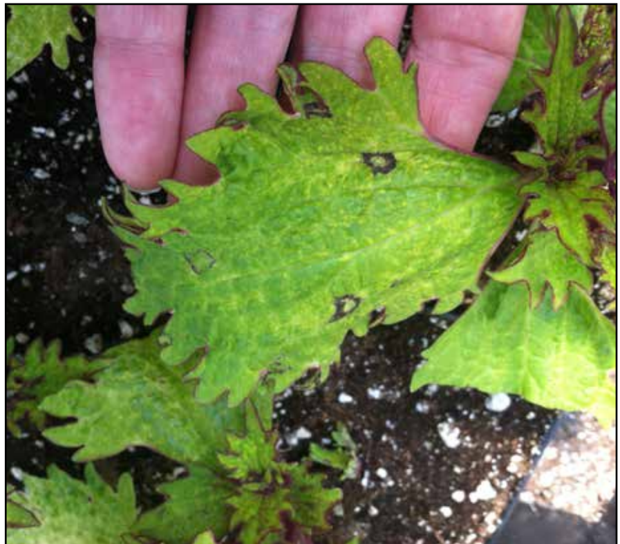
Ringspots caused by INSV.