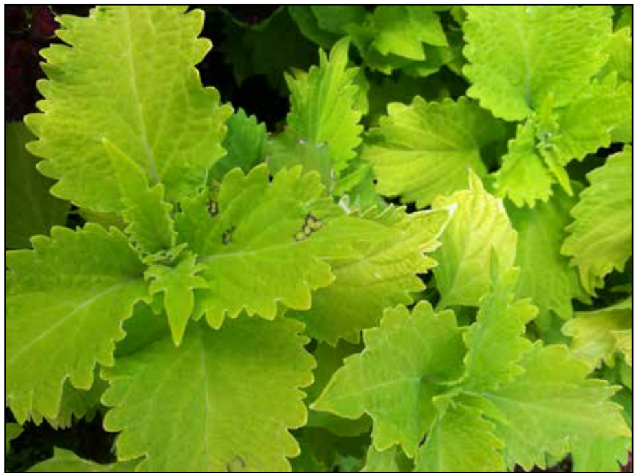
Ringspots caused by INSV.

Subscribe to e-GRO Alert Text "egro" to 22828 or visit e-GRO.org