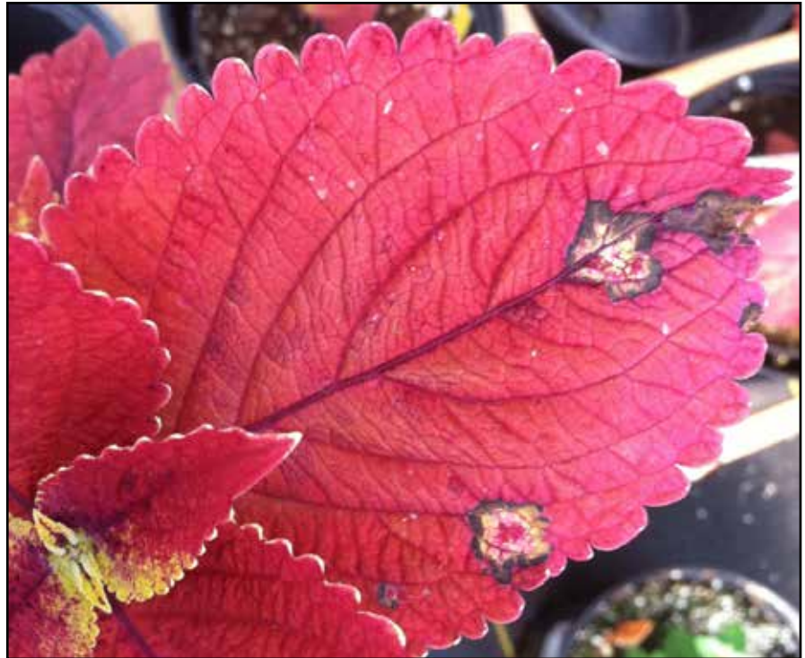
Ringspots caused by INSV.

Where trade names, proprietary products, or specific equipment are listed, no discrimination is intended and no endorsement, guarantee or warranty is implied by the authors, universities or associations.