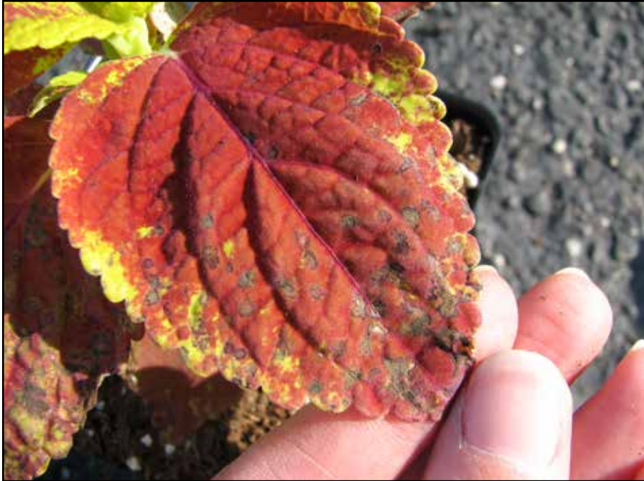
Ringspots caused by INSV.