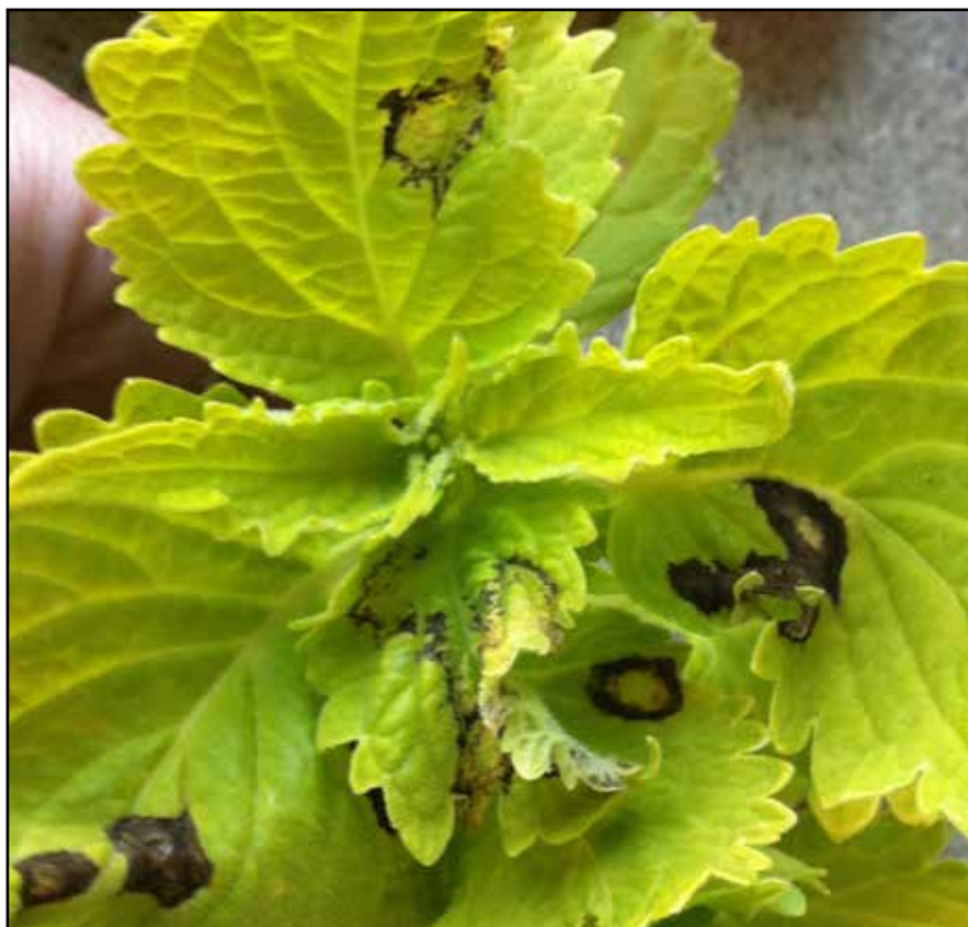
Ringspots and line patterns caused by INSV.

This virus can also be spread through propagation, so be especially careful and scout your stock plants for symptoms and remove INSV-infected plants from propagation.