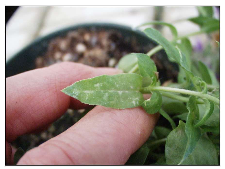
White blotches on leaves on this phlox are signs of injury from an insecticide application.

Where trade names, proprietary products, or specific equipment are listed, no discrimination is intended and no endorsement, guarantee or warranty is implied by the authors, universities or associations.