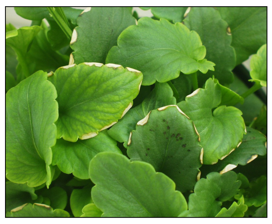
Marginal 'burn' and dark spots on these pansy leaves is from insecticide phytotoxicity.

phytotoxicity has been seen on Colocasia , Geranium , Lobelia , Pansy (flowers), Verbena , and Vinca . We noted some injury to 'Intensia Blueberry' phlox but not other varieties in one trial.