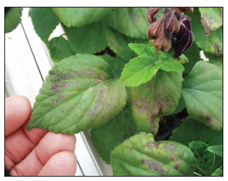
Dead spots or blotches and yellowing are some signs of chemical injury, here on salvia.

Hachi-Hachi: Do not apply to Salvia spp., Impatiens spp, Gypsophila spp, or poinsettias with bracts in color. Temporary