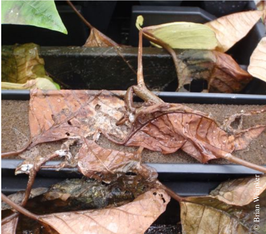
Figure 3. Within a few days, the cutting dies from an Erwinia infection.