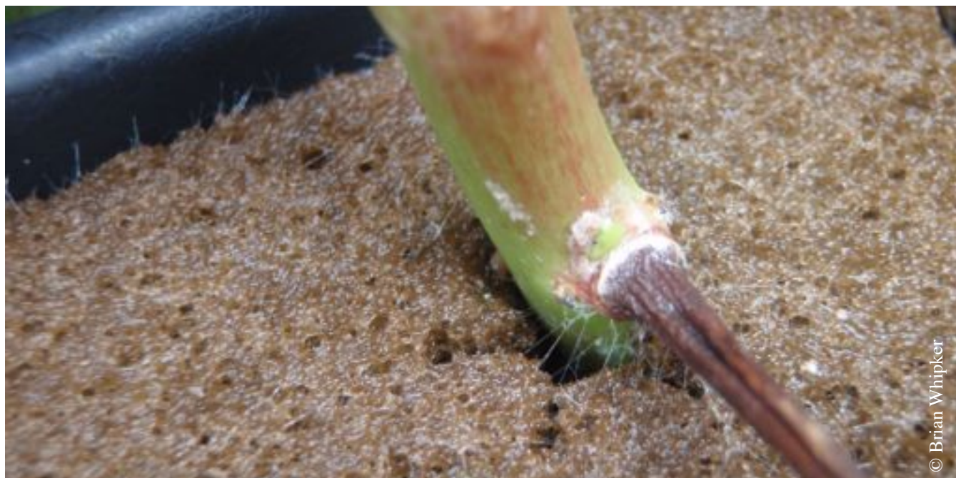
Figure 4. Fungal strands (mycelium) can be seen spreading from cell to cell with Rhizoctonia.