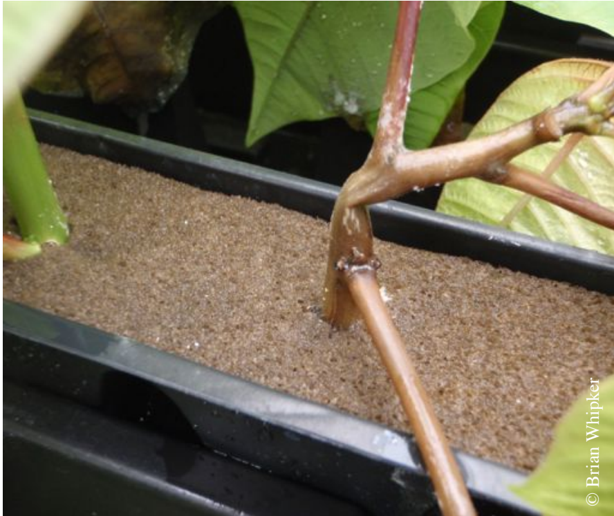
Figure 2. Collapsing stem associated with Erwinia. Check the cutting for a fishy smell to help confirm bacterial soft rot.