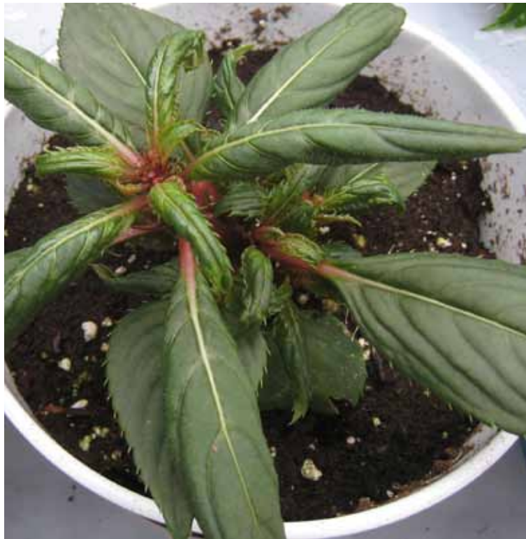
Strap-like, curled/ cupped and twisted new growth of New Guinea impatiens, a result of infestation by broad mites.

Note: As always, read pesticide labels for plant safety information and make sure to follow all label recommendations and restrictions. State or local restrictions apply in some cases; some materials discussed above may not be registered for use in all states.