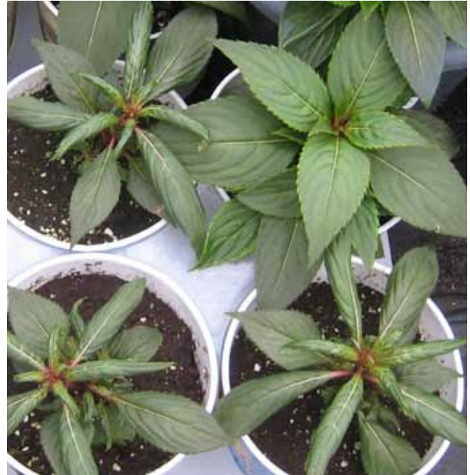
Healthy (upper right) and broad mite infested New Guinea impatiens.

Symptoms can occasionally appear similar to those caused by Western flower thrips feeding on young buds. In addition, some cultural problems, such as nutritional deficiencies, high salts, herbicide injury, or unfavorable temperatures, can also be mistaken for broad mite damage. On some plants chilli thrips injury can be mistaken for broad mite injury. If you are unsure if broad mites are the cause of the damage, contact your local extension specialist or diagnostic laboratory for assistance.