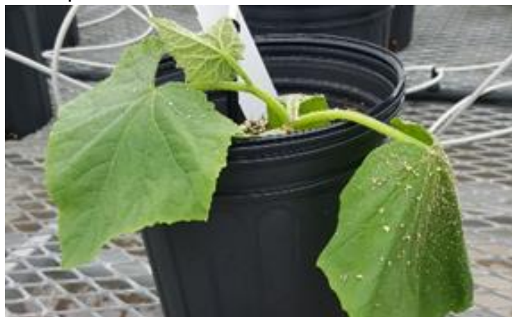
Figure 2. Cucumber wilting as a result of Pythium root rot.