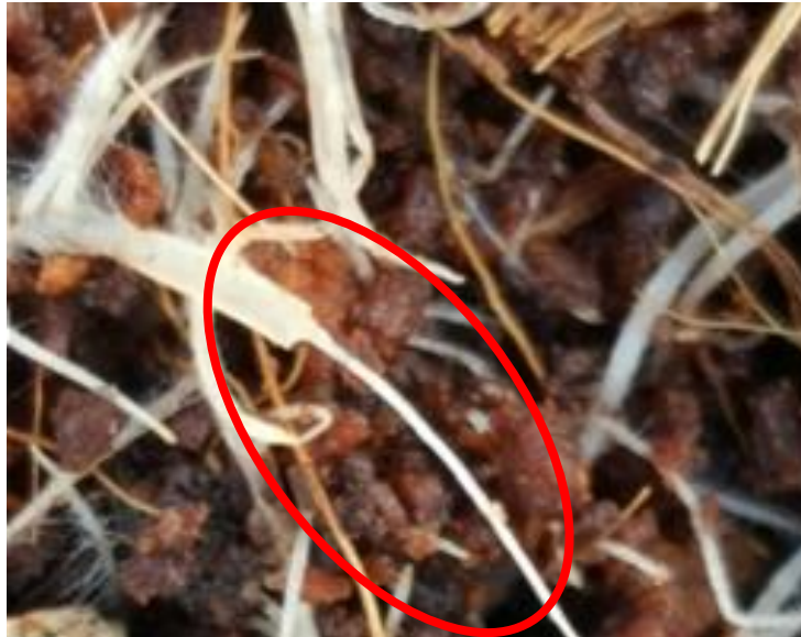
Figure 4. “Sloughing” of a root infected with Pythium (red circle). The outer root cortex strips off, leaving the thinner vascular tissue.

In some cases the visual differences between healthy and infected plants are subtle, especially early on, and detecting a problem takes careful scouting.