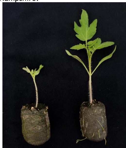
Figure 3. Stunting on tomato seedlings caused by Pythium root rot. Right plant is healthy and the left plant is infected.