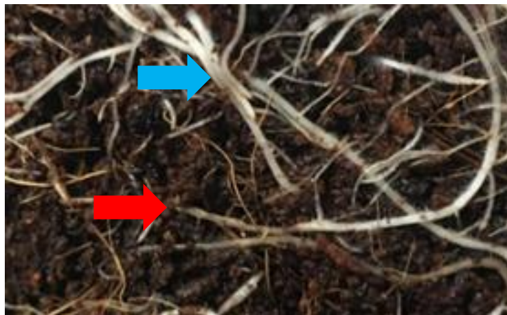
Figure 1. Pythium root rot. Examples of healthy (blue arrow) and infected (red arrow) roots.

Pythium infects through the root tip, and forms brown lesions that damage the root system and progress upwards (Figure 1). Other common symptoms include wilting and stunted growth, as shown in Figures 2 and 3, as well as leaf chlorosis, damping-off, stem cankers, and crown rot. Symptoms often lead to death, especially if left untreated.