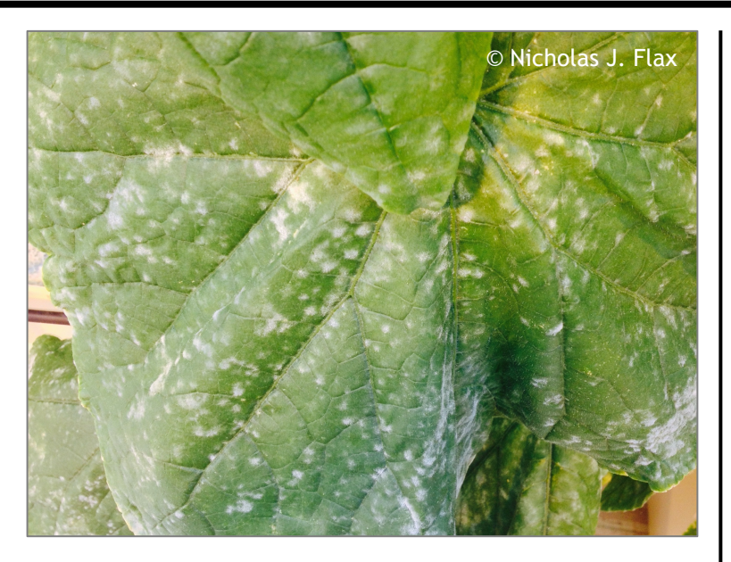
Fig. 1. Powdery mildew can infect a wide variety of greenhousegrown food crops, including cucumber ( Cucumis sativus ; pictured above). Lower, mature leaves, such as the ones shown here, are often the first to exhibit signs of powdery mildew. Thus, scouting for this disease should begin in the lower canopy of any crop.

Overview & Life Cycle (cont) . beginning of the growing season, which provide the primary source of infection in a given year. Once infection occurs, these fungi reproduce rapidly in infected tissue via asexual spores called conidia. These conidia are disseminated by wind and, in some cases, can be spread from plant to plant by insect pests (ex. wooly aphids).