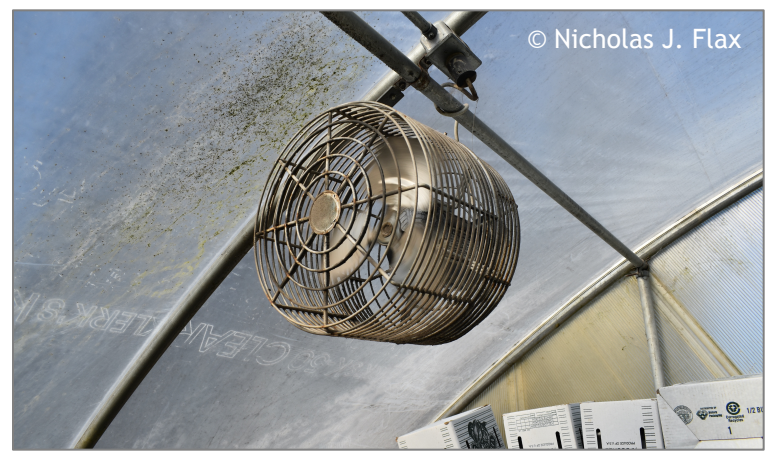
Fig. 4. Increasing airflow in your production environment is an effective way to reduce powdery mildew pressure. Whether the number of horizontal air flow (HAF) fans or total air movement is increased, both are meaningful steps to reduce disease.

Summary. Managing powdery mildew in greenhouse-grown food crops is critical to maximizing profits. If disease pressure is not managed appropriately, yield of fruitbearing crops can decrease, and leafy crops may become unsalable. Reduce relative humidity, increase airflow, and employ chemical or biological controls if necessary.