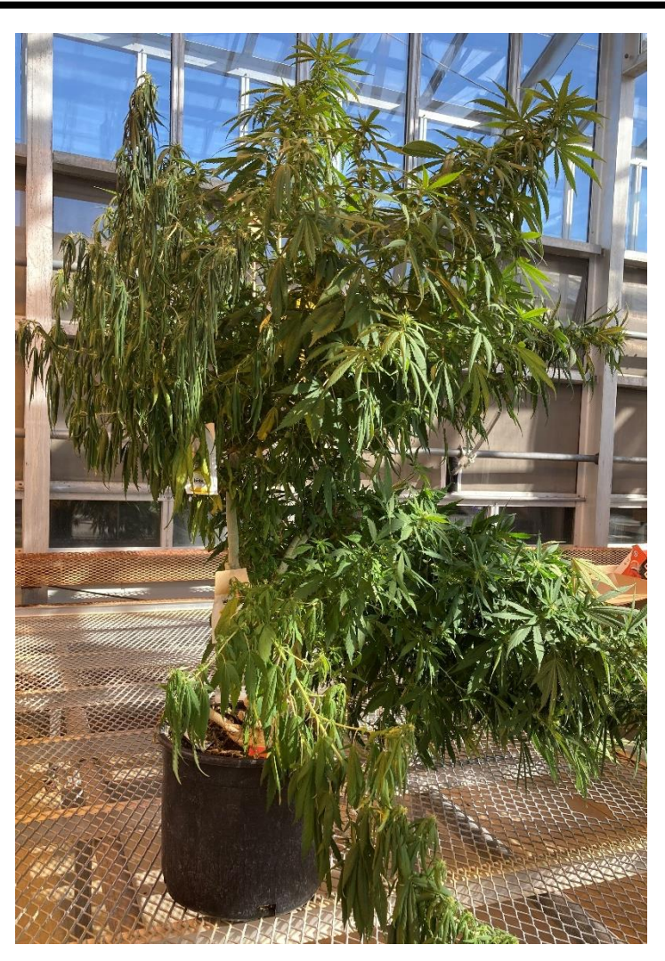
Figure 2. A mother plant of hemp exhibiting severe wilting of leaves and branches due to infection with Fusarium oxysporum .

F. oxysporum can come from water, air, substrate or from contact with a contaminated source. Roots, stems, and flowers are susceptible. The pathogen can be found at all stages of the hemp plant growth cycle, which means it can be spread to all areas of a facility. Fusarium favors warm and humid environments, and warm soil temperatures. In the soil, Fusarium fungi is capable of remaining viable for long periods of time. Soil or media that has been saturated for prolonged periods would be considered susceptible to disease.