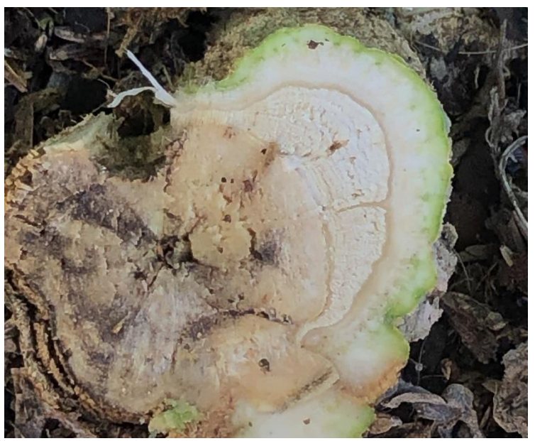
Figure 3. Discolored water-conducting vessels apparent when cutting through the stem near the base is a sign of Fusarium oxysporum . Image: Erica Hernandez, Griffin GGSPro.