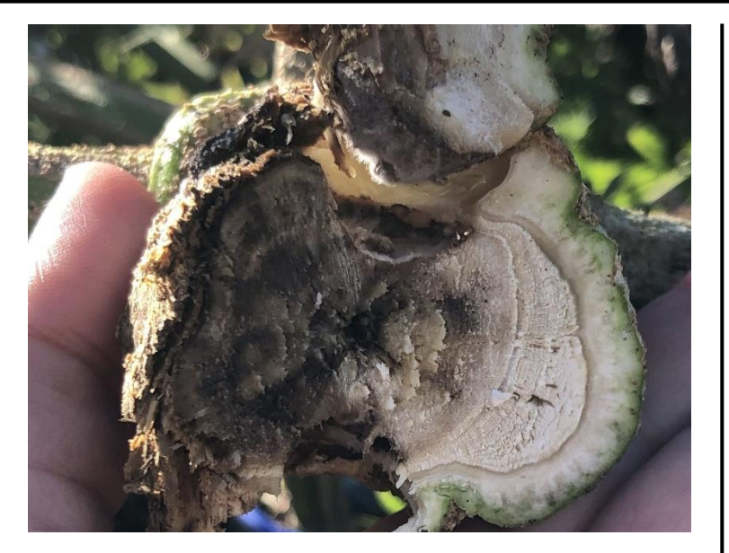
Figure 4. Advanced vessel discoloration apparent on a stem section from a hemp plant infected with Fusarium oxysporum .