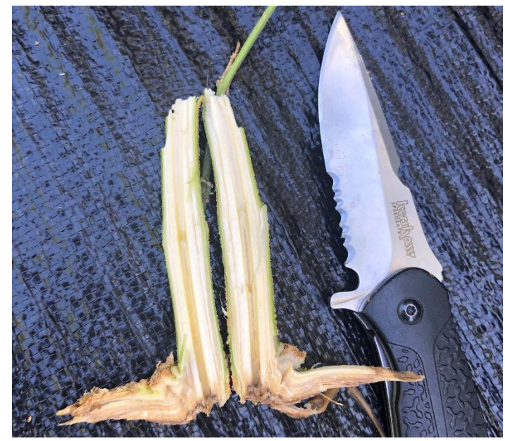
Figure 5. Reddish brown vessel discoloration visible along the length of a lower hemp stem due to Fusarium infection.

The distribution of F. oxysporum through aerially dispersed spores and through the vegetative cuttings from stock plants are critical methods of dispersion. Once sporulation occurs, infected crown tissues can even spread the disease to flowers of neighboring plants. Currently, there are no disease-free certifications being offered by plant propagators for hemp Fusarium wilt. Taking a cutting from an infected stock plant can spread the infection through the propagule. The spread of F. oxysporum through stock plants is suspected to occur through xylem and pith tissues.