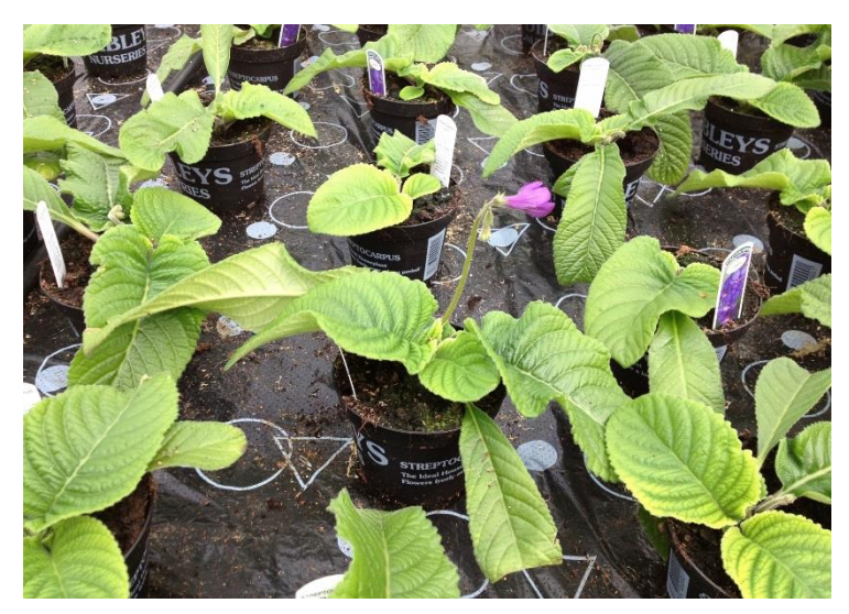
Streptocarpus - overall yellowing of the plants with advanced symptomology of low substrate electrical conductivity.