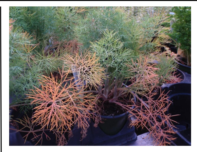
Dill - lower leaf yellow and orange coloration associated with low substrate electrical conductivity.