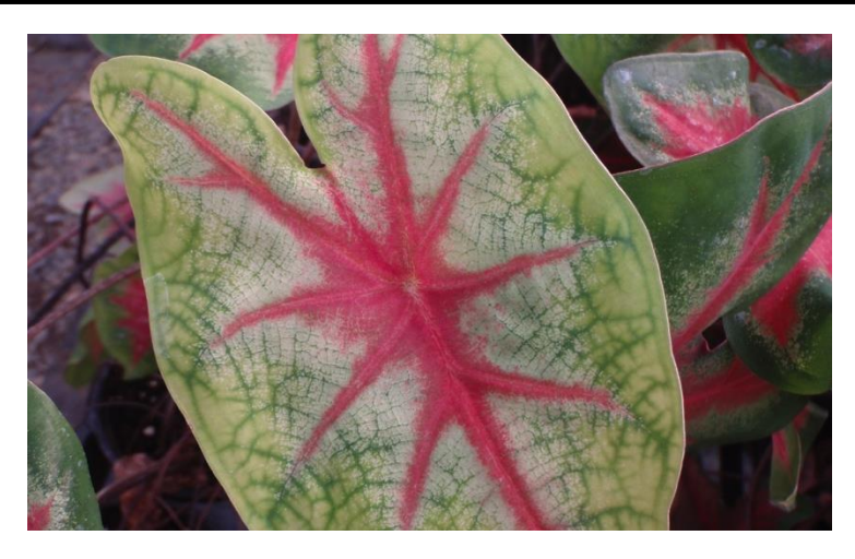
Caladium - typical symptomology of high substrate pH (upper foliage interveinal chlorosis).

The target pH for many species is between 5.8 and 6.2. Higher pH values will result in Fe deficiency and lead to the development of interveinal chlorosis on the upper leaves. Check the substrate pH to determine if it is too high. Be careful when lowering the substrate pH, because going too low can be much more problematic and difficult to deal with.