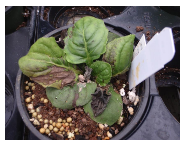
Gerbera - symptoms of excess substrate electrical conductivity with the associated tissue necrosis.