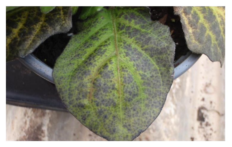
Gerbera - typical symptomology of low substrate pH induced iron/manganese toxicity on the lower leaves.