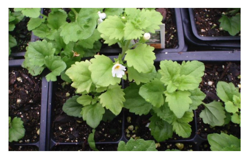
Bacopa - more advanced symptomology of elevated substrate pH in which the leaves have an overall yellow coloration.