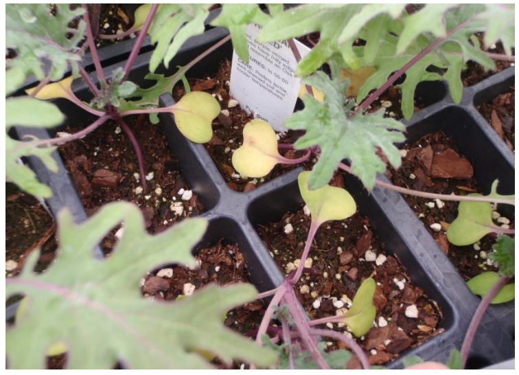
Red Russian Kale - lower leaf yellowing associated with low substrate electrical conductivity.

If the EC values are excessively high, leach the substrate twice with back-toback clear water irrigations. Then allow the substrate to dry down normally before retesting the EC. If EC levels are still too high, repeat the double leach. Once the substrate EC is back within the normal range, use a balanced fertilizer at a rate of 150 to 200 ppm N.