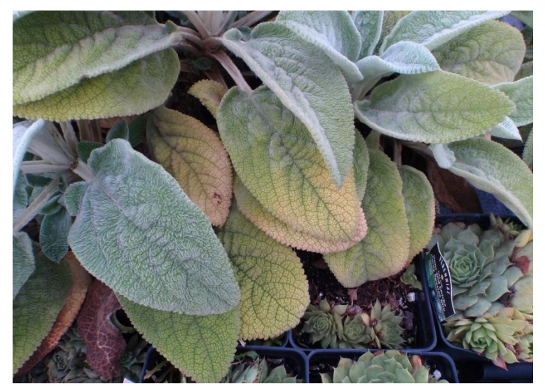
Lambs Ear - lower leaf yellowing associated with low substrate electrical conductivity.