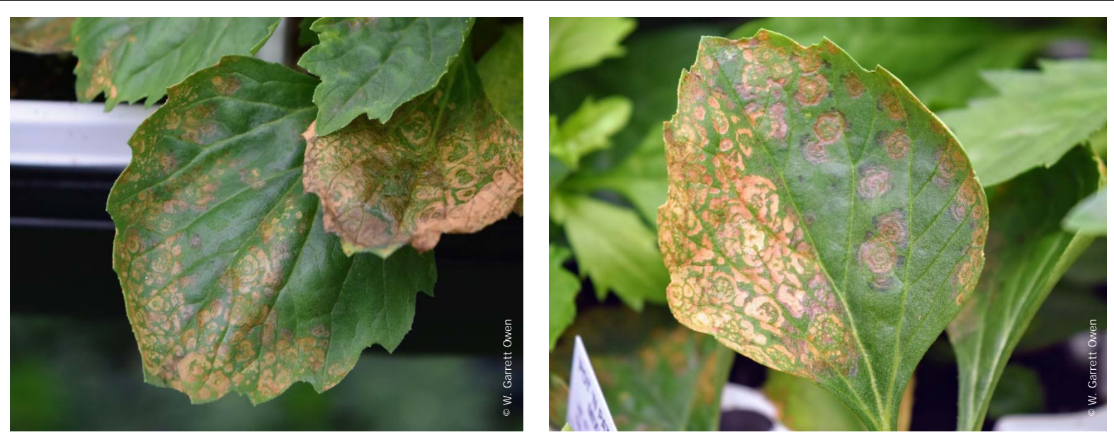
Figure 5. Varying magnitude of lower leaf bronzing with necrotic (dead leaf tissue) concentric rings in annual asters ( Callistephus chinesis ) tested positive for tomato spotted wilt virus (TSWV).