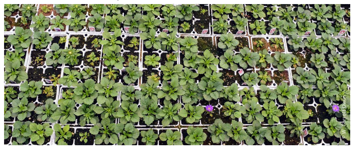
Figure 1. Crop of annual asters (Callistephus chinesis) with stunted growth.

On a recent greenhouse visit, multiple crops of annual or China asters (Callistephus chinesis), at different stages of growth, were inspected. Plants within each crop had stunted growth (Fig. 1 and 2). Upon closer inspection, dark green mottling (Fig. 3), leaf bronzing (Fig. 4), and necrotic (dead leaf tissue) concentric rings (Figs. 5 and 6) were observed. Symptom severity varied across crops and individual plants. Plants with the symptoms described and shown in images (Figs. 1-6) were submitted to Michigan State University's Diagnostic Services Lab for testing. Plants were tested with an enzyme-linked immunosorbent assay (ELISA) test for four viruses found in