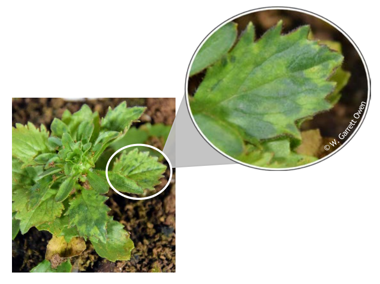
Figure 3. Dark green mottling of stunted annual asters ( Callistephus chinesis ) tested positive for tomato spotted wilt virus (TSWV).