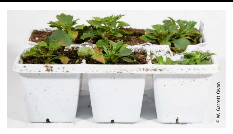
Figure 2. Cell pack annual asters ( Callistephus chinesis ) with stunted growth.

The images (Figs. 1-6), in this article, show symptoms caused by TSWV on annual asters. Note that the severity of symptoms caused by TSWV are influenced by several factors including the age of the plant at the time of infection, and the host plant's sensitivity. Plants that are infected at a young age tend to develop more severe symptoms than those infected at maturity. As already noted, this virus has a wide host range, however symptoms vary in severity across hosts. Observations made during the recent greenhouse visit indicate that annual aster can be severely affected by TSWV. Plant death has been observed (Fig. 7).