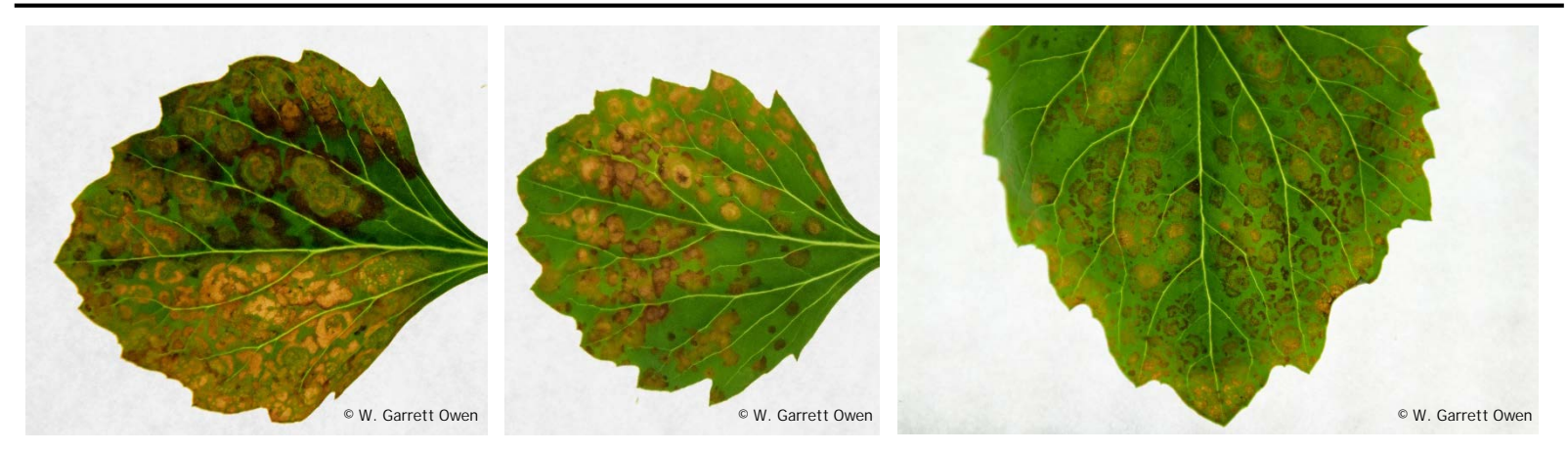
Figure 6. Backlit leaves with varying magnitude of lower leaf bronzing with necrotic (dead leaf tissue) concentric rings in annual asters ( Callistephus chinesis ) tested positive for tomato spotted wilt virus (TSWV).

delay between the time when a plant is infected and when symptoms are noticeable. During this time they can serve as a source from which the virus can be further spread. The amount of time it takes for infected plants to become symptomatic can vary and is also impacted by the host, the age of plant at infection, and the growing conditions. In some instances, plants may remain symptomless (Daughtrey et al., 1995). To accurately determine if plants are infected with TSWV or INSV, one should submit a plant sample to their preferred diagnostic lab and quarantine the plant material until test results are available. One may choose to use in-house test kits to screen plant material.