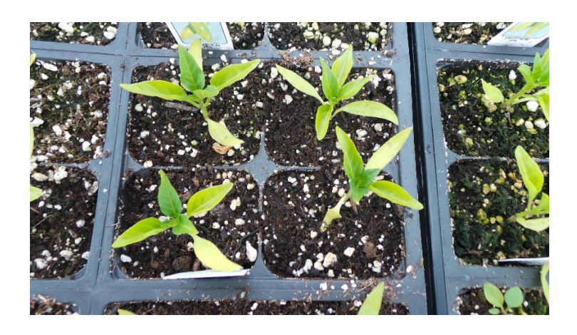
If the media appears saturated, but is actually very dry below the surface there may be a media issue.