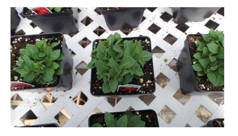
Observed differences in plant growth rates of the same cultivar in potting media from 2016 and 2017 led the grower to believe that there was a potting media issue. Later that spring it was confirmed that there was an issue with the 2017 media.

In 2017 a potting media company made me aware that they were observing issues with some of the growing media that was shipped into my area. While they proactively addressed the issue with the growers that they had on record purchasing the media, many smaller growers purchase their media indirectly though larger neighboring growers and unfortunately they did not get notified. As a result, media packaged for the 2017 growing season was utilized by smaller growers for the 2018 production year resulting in significant, but not necessarily irreversible cropping issues in their operations.