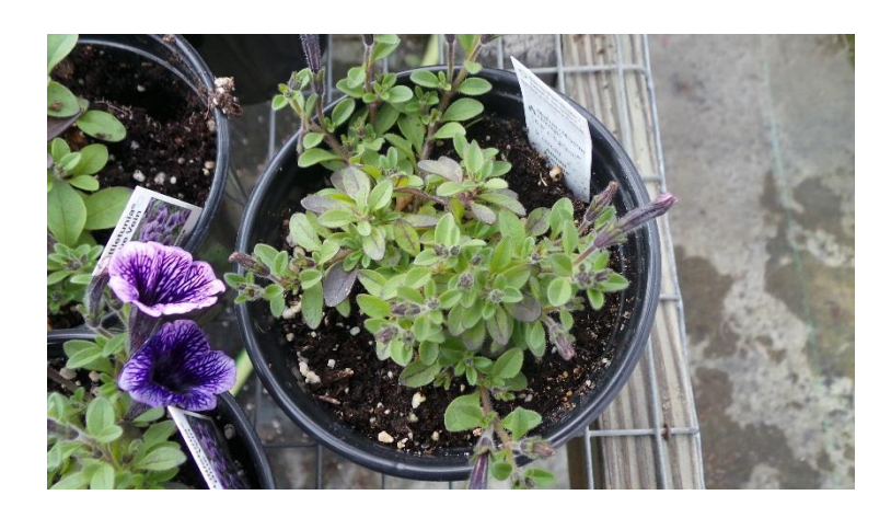
When a grower notices that specific cultivars planted in different media under the same fertility program are growing abnormally you may begin to suspect that there is a media

After ruling out environmental factors. Pathogens, and specific management issues we will typically recommend that the grower contact their media supplier to see if there were any reports of media issues for that growing season. The potting media companies will often send out their local representative to pull samples and to review the growing practices that have led up to the cropping problem. Most media companies use a variety of proprietary materials when manufacturing their media so when a media problem is suspected they are the only entity that can truly evaluate the media and its properties.