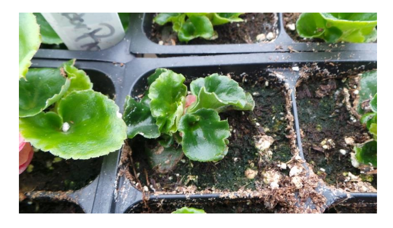
When you observe leaf distortion and stunting you are typically not observing a media issue, but a PGR mistake.