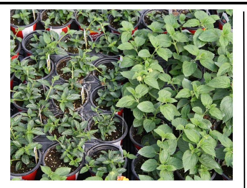
Figure 1. 'Landmark Peach Sunrise' lantana, a vigorous cultivar, grown in a standard peat moss and perlite substrate and treated with 2-fluid oz. drenches containing 0 to 4 ppm ancymidol, flurprimidol, paclobutrazol, or uniconazole.