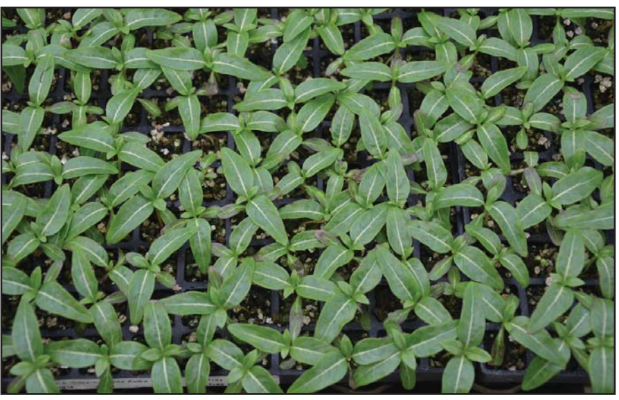
Figure 2. Iron chelate phytotoxicity appears as dark leaf necrosis on vinca.

Do not confuse foliage iron burn for other issues. Severe thrips damage and necrosis from downy mildcan often mimic foliar iron phytotoxicity symptoms (Figure 5).