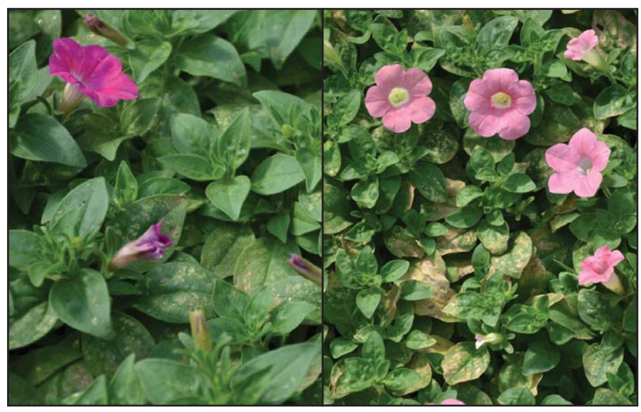
Figure 3. Iron chelate phytotoxicity progresses from speckling (left) to severe leaf necrosis (right) in petunia.