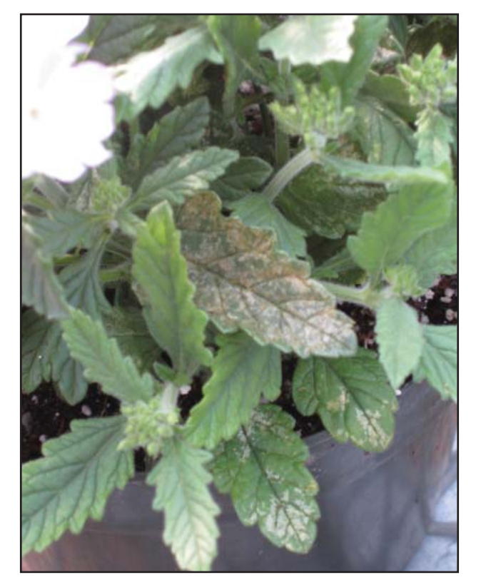
Figure 5. Severe thrips damage (top left) and downy mildew symptoms (bottom) can mimic foliar iron chelate phytotoxicity.