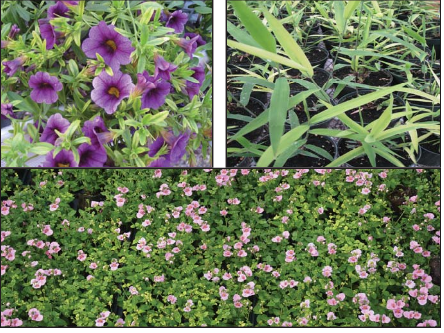
Figure 1. Interveinal chlorosis is a sign of an iron deficiency in calibrachoa (top left), chasmanthium (top right), and diascia which are considered iron-inefficient crops (bottom).

high substrate pH (>6.2), iron is not taken up by the roots. Iron, a micronutrient is more soluble in a substrate with low pH. Plants that fall