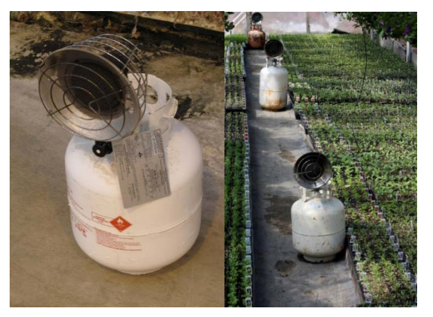
Figure 5. Unvented portable propane heaters should never be used in a greenhouse.