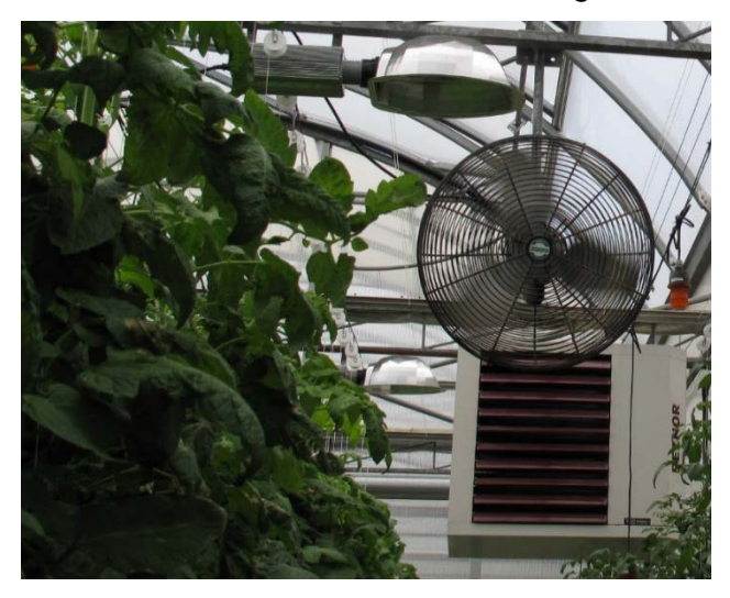
Figure 1. Unit heater in a high wire tomato production greenhouse.

The recent artic air sitting over much of the United States is causing greenhouse heaters to run much more frequently or be turned on for the first time in southern locations. Over the past two decades, growers in temperate regions have reduced their heating bills by insulating and sealing up their greenhouses or they have taken advantage of new greenhouse designs and technologies. Regardless of these changes, most rely on either unit heaters or boilers to heat their greenhouses during the winter months. Some smaller growers may also burn wood within