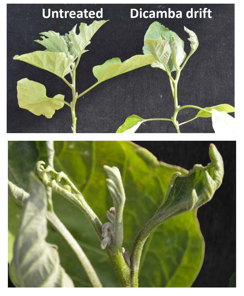
Figure 10. Eggplant with (top right and bottom) and without (top left) drift injury from the herbicide dicamba. Note the distortion occurs on the newest growth, as with all auxin injury. (Photo: Erin Hill, MSU)

Figure 11. Poinsettia showing twisted petioles and malformed leaves as a result of movement of a turf herbicide application outside the greenhouse aimed at broadleaf weed control. (Photo: Erin Hill, MSU)