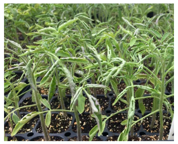
Figure 7. Epinasty of tomato leaves after exposure to ethylene.