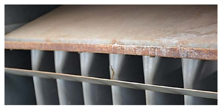
Figure 3. A cracked heat exchanger on a greenhouse unit heater.