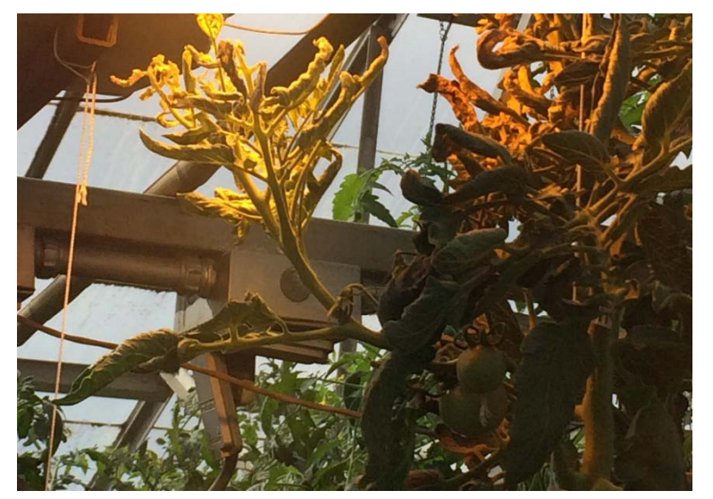
Figure 9. Curling and distorted tomato leaves from heat stress caused by close proximity to high-pressure sodium lamp.

Synthetic auxin herbicides (ie. 2,4-D, dicamba, clopyralid, etc.) are another source to consider. If injury is observed during the outdoor growing season, consider the possibility of drift from areas adjacent to the facility, particularly if the severity of symptoms concurs with areas of air intake (Figures 10 and 11). These types of herbicides are prone to movement and in some cases have been seen to cause injury to highly sensitive plants miles away. If irrigation is being pumped from areas with surface exposure, also consider herbicide use around that body of water as these herbicides are highly soluble.