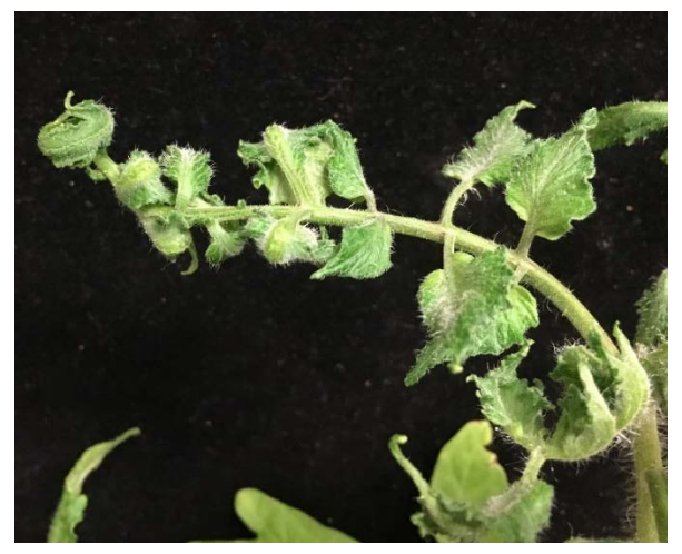
Figure 8. Close up of a tomato leaf exhibiting ethylene injury. This can be confused with herbicide injury.