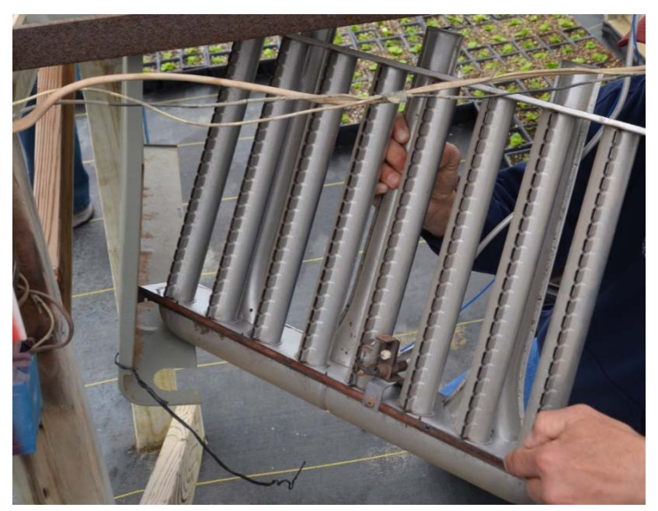
Figure 4. Route heater inspection and maintenance can prevent crop damage and losses and potential carbon monoxide exposure