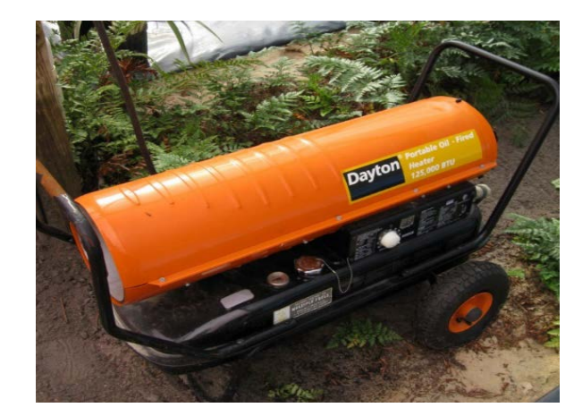
Figure 6. Unvented gas powered heaters should never be used in a greenhouse.